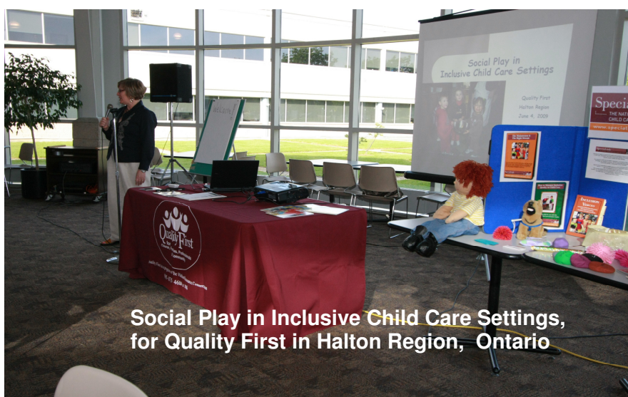
Social Play in Inclusive Child Care Settings, for Quality First in Halton Region, Ontario